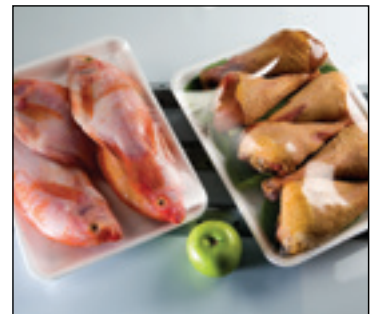
Breathable film, allowing more food preservation