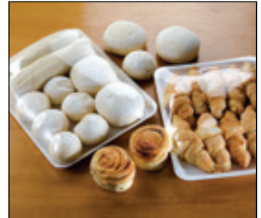
Keeps food fresher