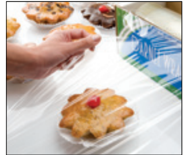
Easy to handle

* More micronage / lengths / widths / consult.