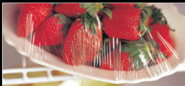
Suitable for use in refrigerator