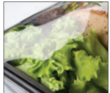
Breathable film, allowing better food preservation