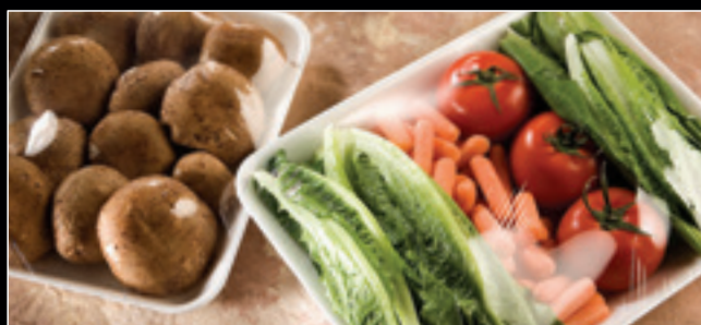
Prolongs the life of the products