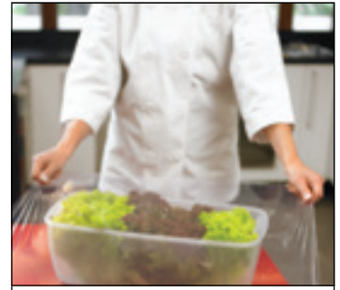
Great anti fog properties